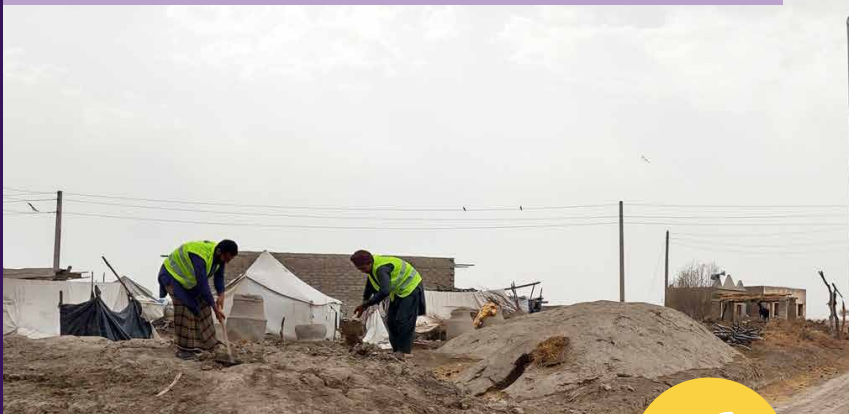
Work has begun on the foundations for Abdul Kareem Chandio.

The first phase of the Shelter Project in Pakistan has nearly been completed in the village of Ghulam Hussain Chando, building homes for 300 families who lost their homes in the brutal 2022 floods.