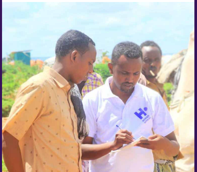
Human Appeal staff registering people.

Distributed 595 food parcels to families in vulnerable situations in Somalia. Each food parcel contains 25kg of rice, 25kg of flour, 10kg white sugar, 3 litres of cooking oil, and 3kg of dates.