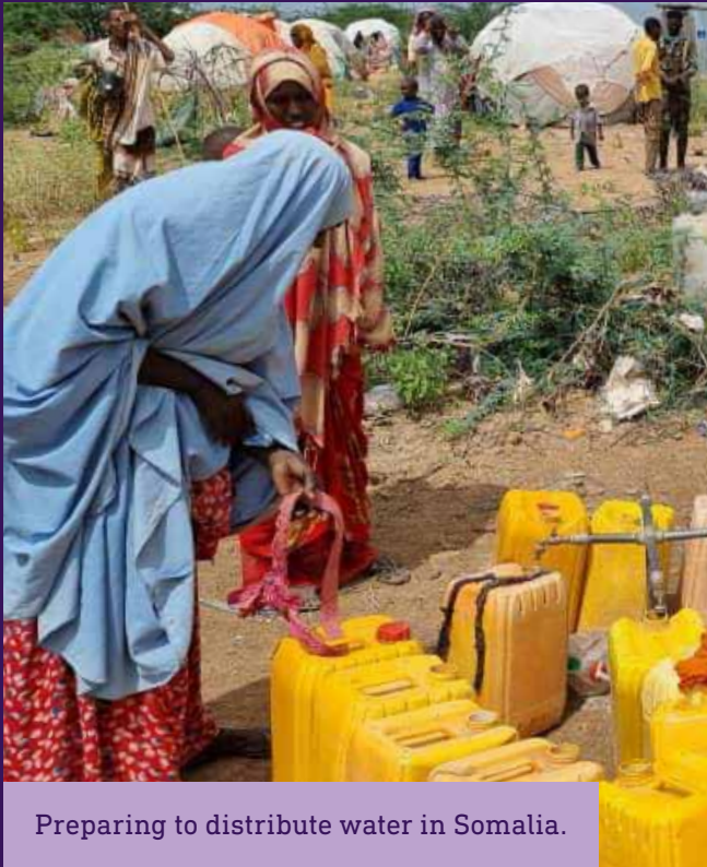
Preparing to distribute water in Somalia.