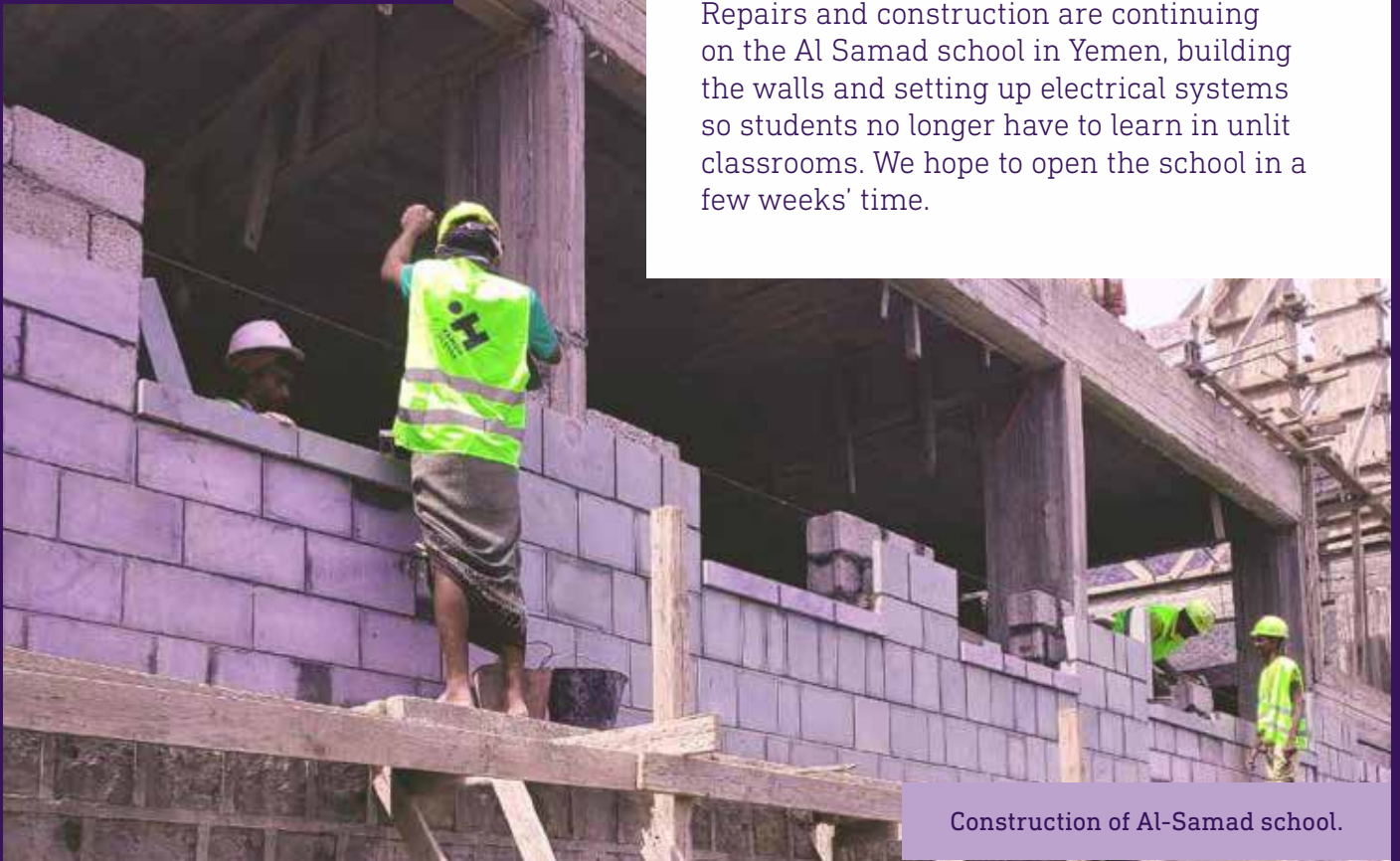
Construction of Al-Samad school.

Repairs and construction are continuing on the Al Samad school in Yemen, building the walls and setting up electrical systems so students no longer have to learn in unlit classrooms. We hope to open the school in a few weeks' time.