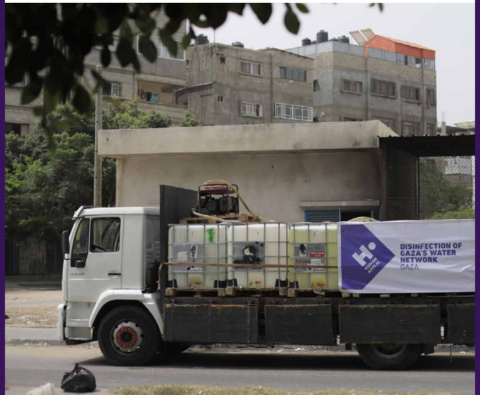
Truck carrying disinfectant materials.

We distributed over £40,000 worth of medicine and medical disposables to hospitals across Gaza to help them keep their services running following the violence in May, which badly stretched already limited medical supplies.