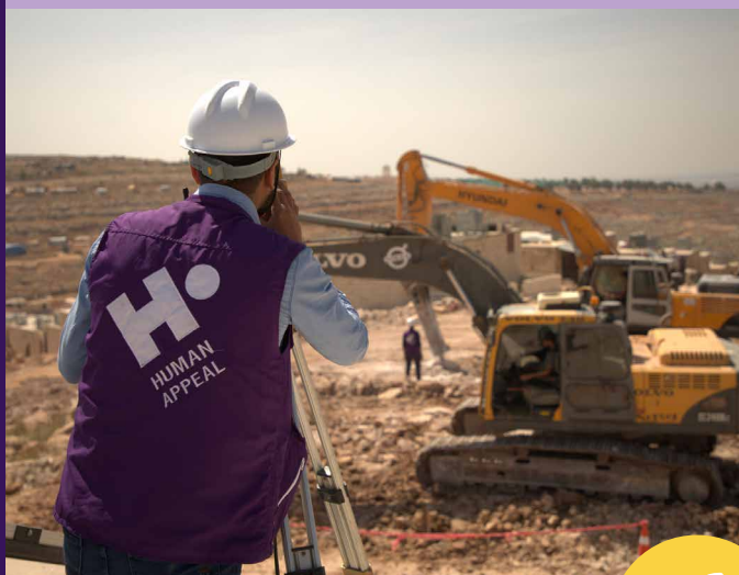
Construction ongoing in Al Zohoor.

Our nutrition team continues to visit displacement camps in the Atmaa Killi area in northwest Syria, examining cases of malnutrition in children and pregnant women, providing awareness sessions on preventing malnutrition and cholera, and giving referrals to healthcare centres.