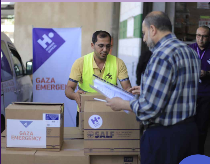
Medical supplies being distributed to hospitals.

Construction has begun on a new desalination plant in Gaza, in the Abdel Shafi Community Health Association, which will benefit both the patients who receive care there, and the 150 doctors, nurses and staff members at the Association.