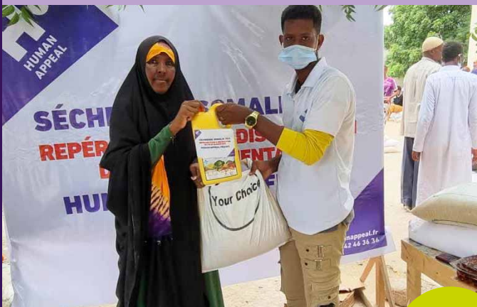
Food distribution in progress in Somalia.

Human Appeal launched a water supply project for displaced people in the Bardere district, which will provide families in vulnerable situations with 45 litres of clean water each day for a month.