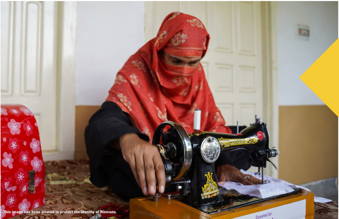
This image has been altered to protect the identity of Rizwana.