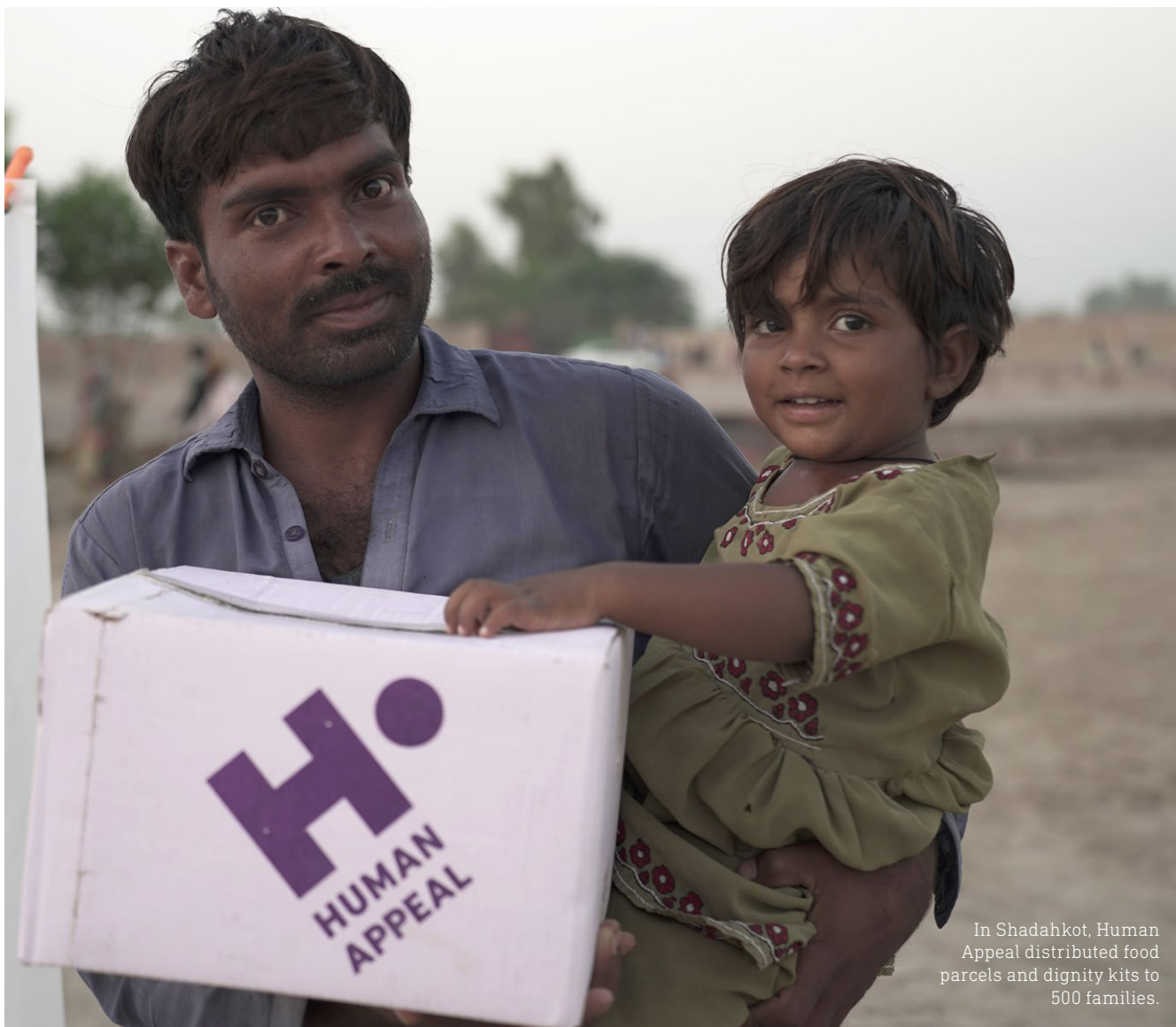
In Shadahkot, Human Appeal distributed food parcels and dignity kits to 500 families.