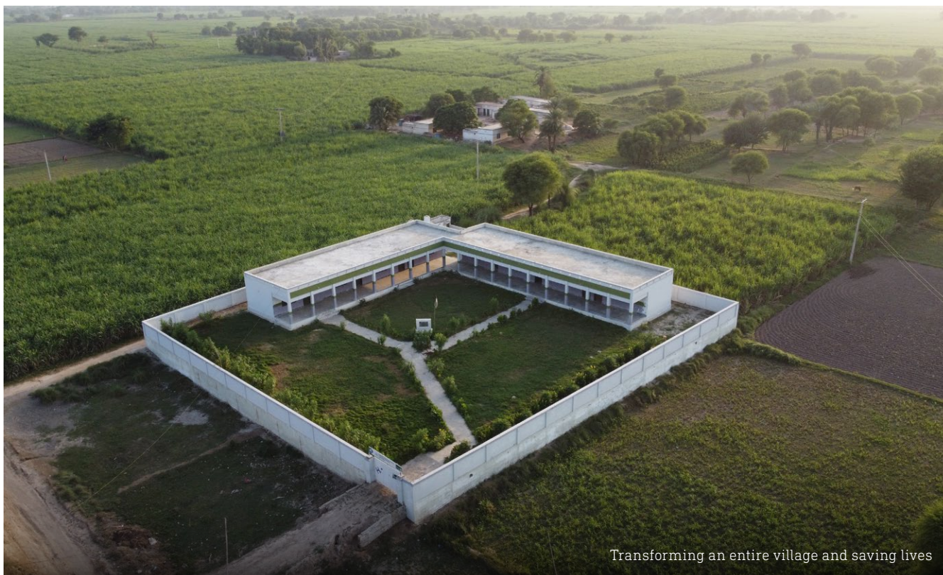
Transforming an entire village and saving lives