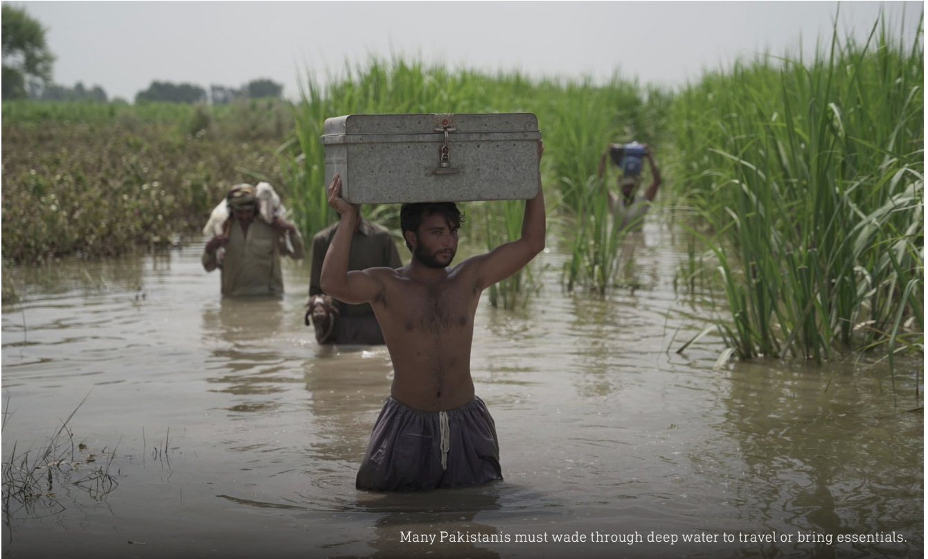
Many Pakistanis must wade through deep water to travel or bring essentials.