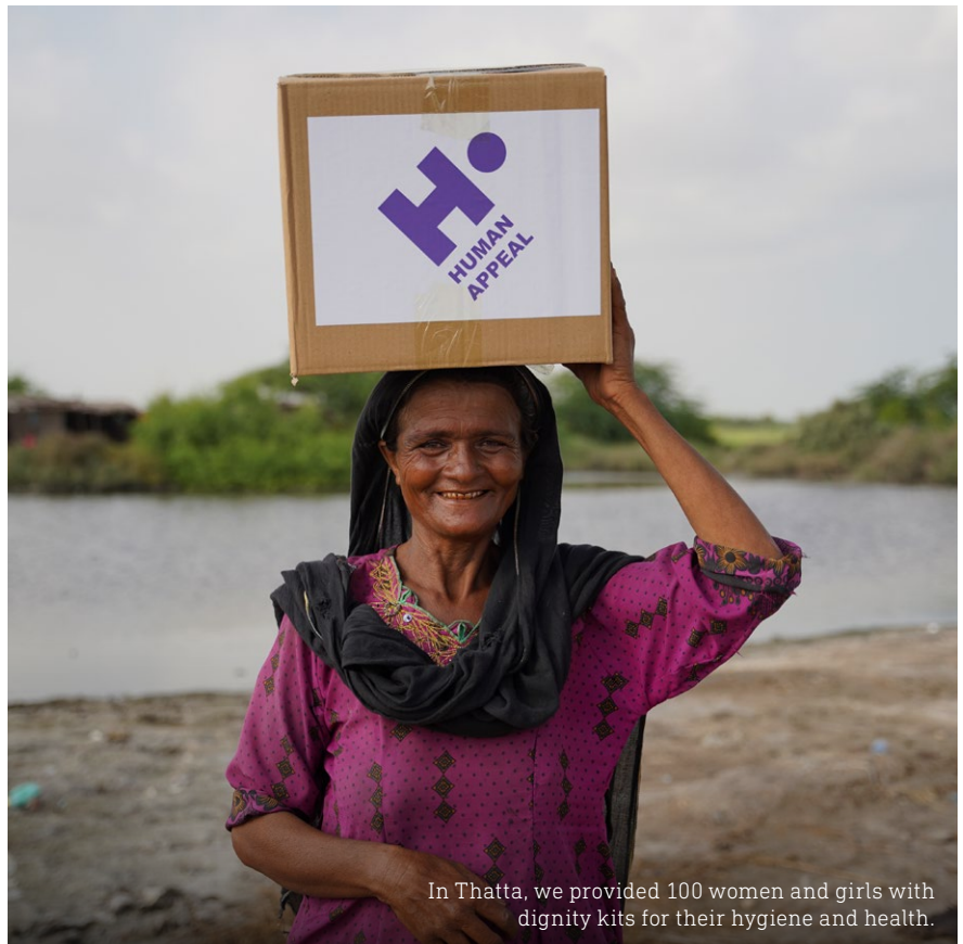
In Thatta, we provided 100 women and girls with dignity kits for their hygiene and health.

flood affected people provided with unconditional cash assistance